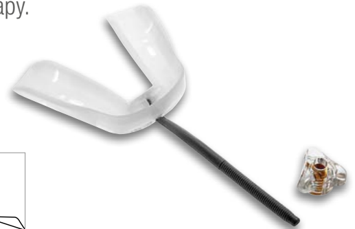
Lower jaw splint incl. screw, AM Aligner and instructions.